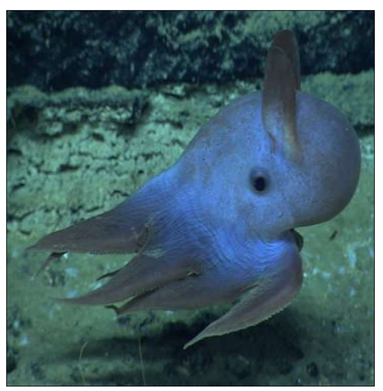
Pictured: An example of a 'Dumbo' octopus.

The deepest ever sighting of an octopus has been made by cameras on the Indian Ocean floor. The animal was spotted 7,000m down in the Java Trench, a deep submarine depression near the southern part of Java, Indonesia. It is a species of "Dumbo" octopus. Known as the cutest octopus in the world, the Dumbo octopus has fins on its mantle that look like the huge ears of Dumbo the Elephant. They flap these strong fins to propel themselves through the water. They feed on snails, worms, and other creatures they hoover up from the ocean floor. The 35cm long invertebrate was captured by researchers with the Five Deeps Expedition using lander machines, which are autonomous camera systems that are released from a ship and sink to the bottom of the ocean.