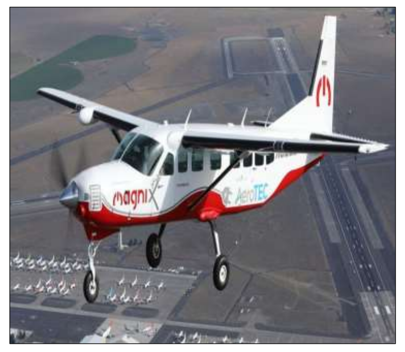
Pictured: The modified Cessna Caravan that had its first flight at Moses Lake, powered by electric batteries.

The world's largest all-electric aircraft has made its first successful flight, landing safely in Moses Lake, Washington. The Cessna Caravan 208B, modified to run with an electric engine, took 28 minutes to complete its first flight. The nineseater plane was created by engine company magniX and aerospace firm AeroTEC working together. This flight is a significant step as it proves a plane this size can be powered by an electric motor. The companies explain the electric plane is more environmentally friendly and costs less to operate than fossil fuel-powered crafts. "As the world's largest all-electric aircraft, this first flight is a significant milestone in disrupting the transportation industry and accelerating the electric aviation revolution," magniX said when they announced the flight.