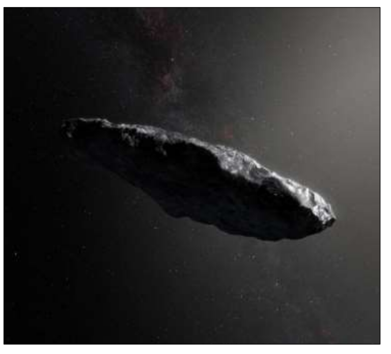
Pictured: An illustration of the Oumuamua comet.

The Oumuamua comet baffled scientists in 2017, when it became the first object, with interstellar origins, to travel through our own solar system. Scientists named it Oumuamua, which means "a messenger from afar arriving first" in Hawaiian. Many theories have been explored since then, one being that it was a cigar-shaped alien spaceship! Astronomers at Yale and the University of Chicago now say it is a hydrogen iceberg! They published a study that says iceberg-like objects made of hydrogen could form in the dense cores of molecular clouds, best known as nurseries for stars. For some of their life cycle, the clouds would have been massive and cold enough for hydrogen to freeze solid, then split and sail away like an iceberg.